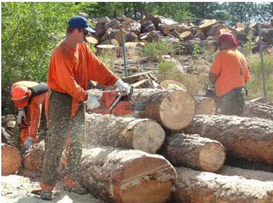
The inmate fire crew from ASPC-Winslow/Coronado cuts wood for the Northern Arizona Food Bank's "Wood for Winter Warmth" program July 21 in Flagstaff.